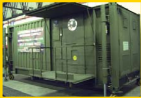
DEPLOYABLE CBRN ANALYTICAL LABORATORY (STANAG 4632)

CONFORM TO THE QUALITY SYSTEM STANDARD AQAP 2110 and ISO 9001:2008