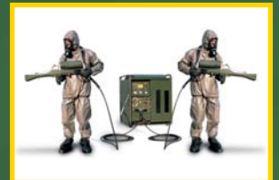
SANIJET C 1126 HR CBRN DUAL OPERATOR DECONTAMINATION AND DETOXIFICATION GROUP