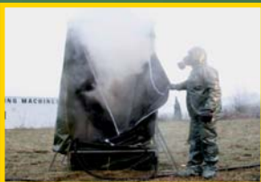
TSDM-TACTICAL STEAM DECON MODULE