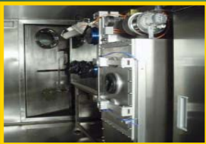
DEPLOYABLE BIO LABORATORY CLASS III BIO SECURITY LEVEL