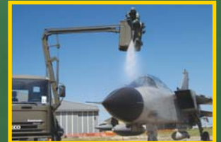
MOBILE SYSTEM FOR AIRCRAFT DECONTAMINATION

ONLY ONE PERSON ONLY ONE MACHINE ONLY ONE PRODUCT