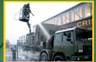
DDMAS LARGE SCALE DECONTAMINATION SYSTEM DUAL OPERATORS