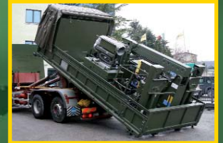
DDMAS LARGE SCALE DECONTAMINATION SYSTEM HIGHLY DEPLOYABLE