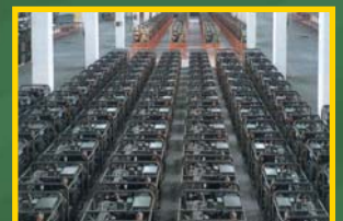
CBRN PRODUCTION LINE

cristanini@cristanini.it - www.cristanini.com