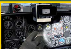
SX34 CBRN DECONTAMINATION OF SENSITIVE EQUIPMENT AND SURFACES