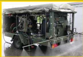
RI/CBRN TRAILER FOR CBRN DECONTAMINATION AND DETOXIFICATION